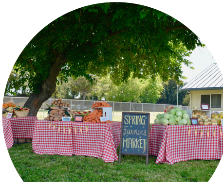
May 29, 2020