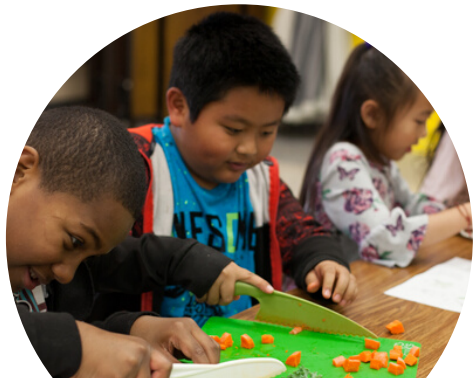
May 7, 2020